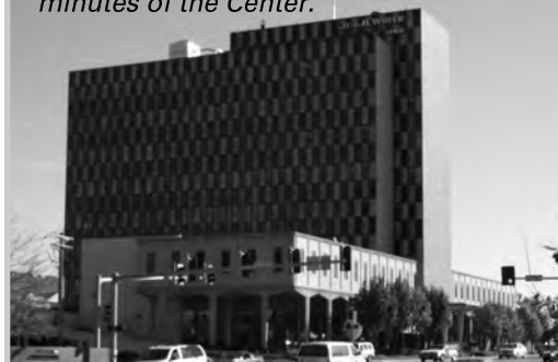
The Foster and Adoption Resource Center will be conveniently located in the Joseph H. White Building.

More than 80% of Metro St. Louis' foster and adoptive families live within 30 minutes of the Center.