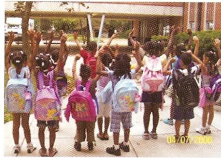
Children showing off their brand new backpacks that they received in a training program. Each backpack had age-appropriate school supplies.

and best practice methods to locate and permanently place foster children with their relatives.