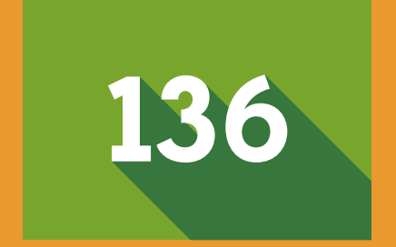
136 individuals were referred for foster care or adoption licensure.