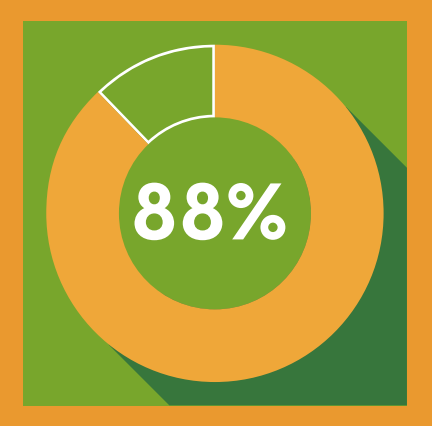
88% or 121 children in crisis remained in their foster/adoptive homes with the help of Family Works.