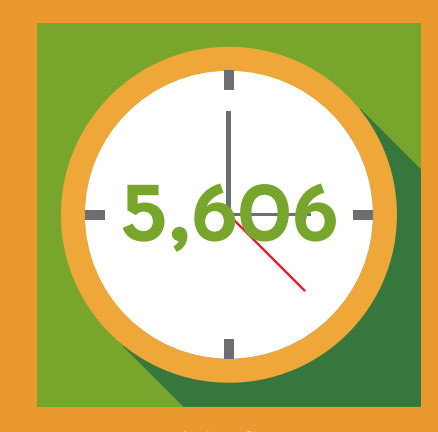
5,606 training hours were provided to foster and adoptive parents.