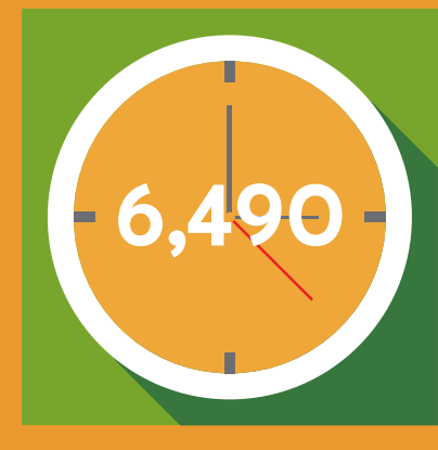
719 volunteers donated 6,490 hours to our children and families.