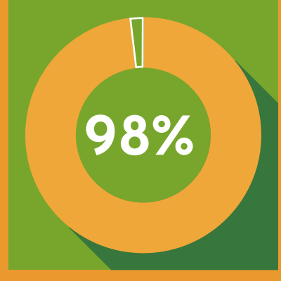
98% of families we helped maintained their foster/adoptive status compared to 40% nationally.