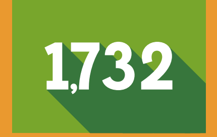
1,732 items of clothing were provided to youth in foster care.