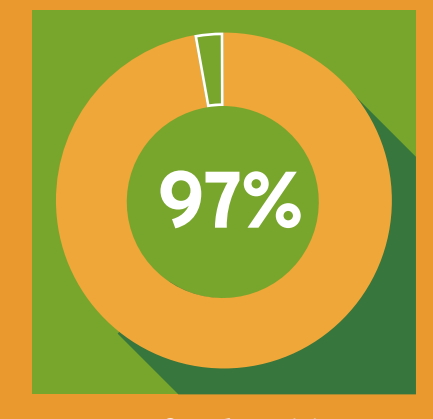
97% of youth receiving Educational Advocacy services met their educational goals.