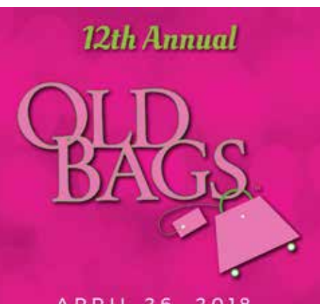
APRIL 26, 2018 HILTON ST. LOUIS FRONTENAC

Benefitting the Foster & Adoptive Care Coalition