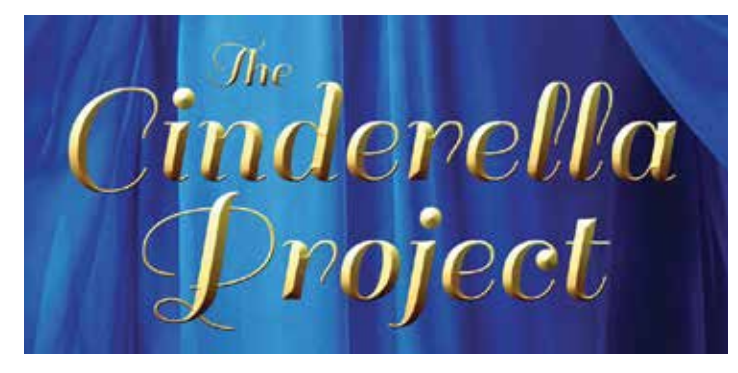
"What I love most about this experience is trying on the dresses. I loved it because this is my first time trying on dresses and I looked so beautiful."

The Coalition is gearing up for Cinderella Project 2018! The Cinderella Project provides dresses to those in the St. Louis metropolitan region who cannot afford to purchase a formal and to all girls attending prom who are currently in foster care. The girls are referred to the Cinderella Project by high school counselors and case managers.