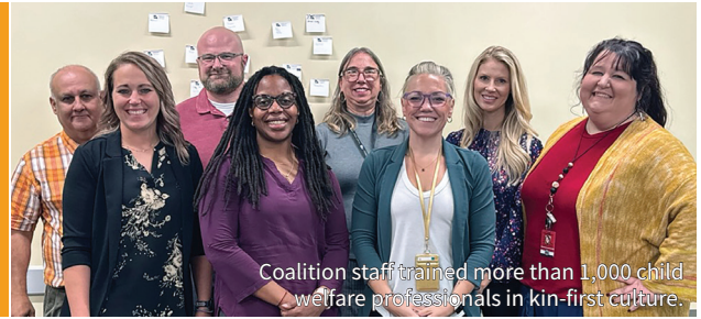
Coalition staff trained more than 1,000 child welfare professionals in kin-first culture.