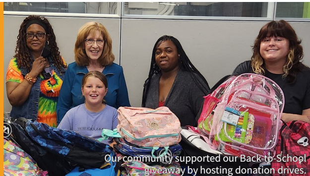
Our community supported our Back-to-School giveaway by hosting donation drives.