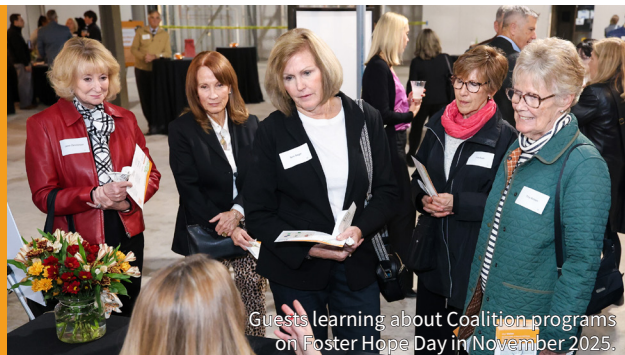
Guests learning about Coalition programs on Foster Hope Day in November 2025.